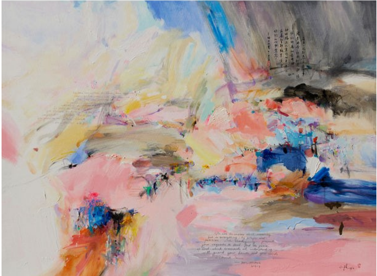
"Power of Prayer" acrylic on linen by XiaoYang Galas ©2020