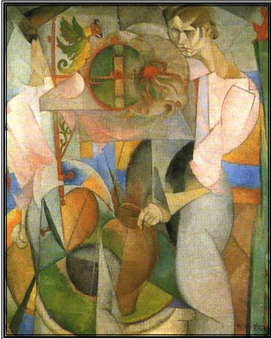
Woman At The Well