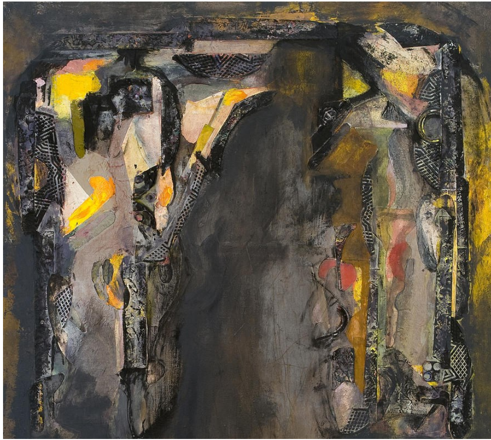
"Go Down, Moses" in mixed media by Seymour Kleinberg, 2016

"...But Moses said to God, 'Who am I that I should go to Pharaoh, and bring the Israelites out of Egypt?'" Exodus 3:11